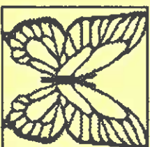
Butterfly quilters: Gail Kozak, Cheri Cooper song: "Butterfly Song"